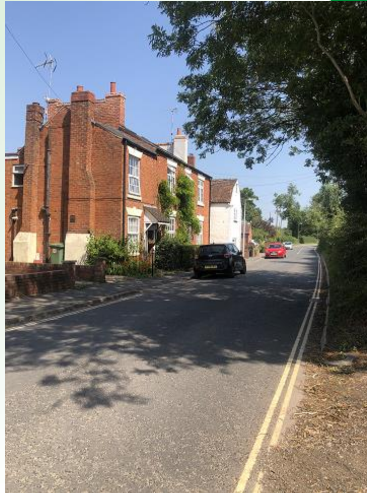
View towards the east (cottages to north)