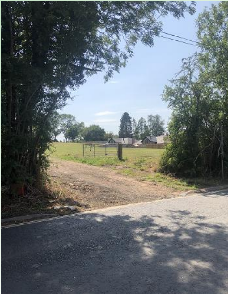
Access to site