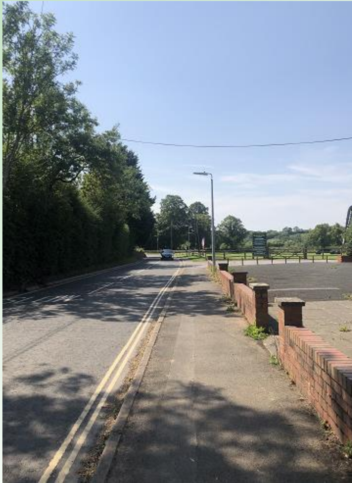
West view into Feckenham